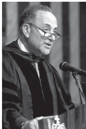
Senator Charles Schumer (NY-D)

told The Collegian . "She is a very hard worker, unselfish and one of the most competitive players that I have coached in my twelve seasons as the head Women's basketball coach at Cayuga. I urge everyone to come to see her play before the season ends, you will not be disappointed. We may never again have as talented a player wearing the Spartan uniform. don't miss your chance to see the all-time leading scorer